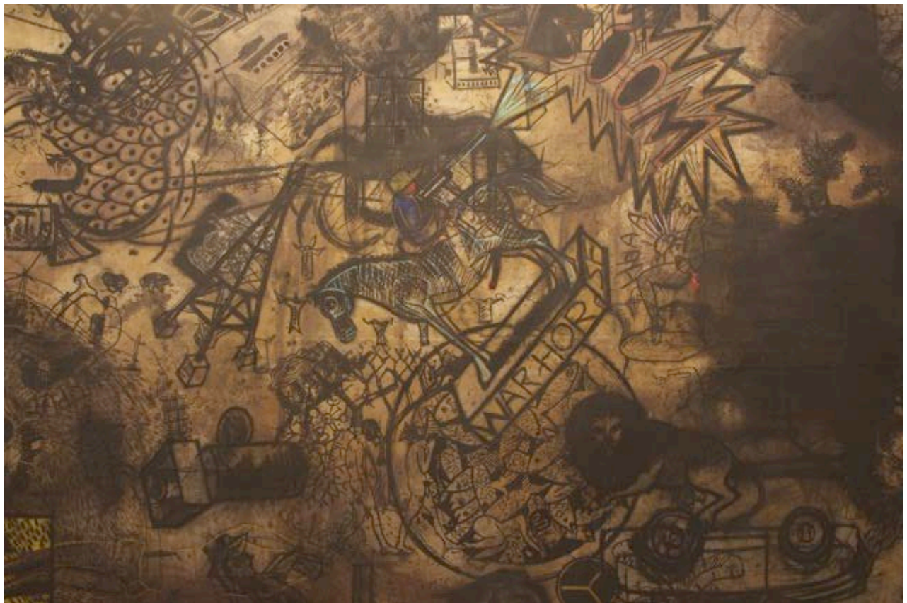
Pancha Mahabhuta (Earth) , 2012 (Detail) Charcoal, ink, collage and dry pastel on rice paper pasted on canvas 96 x 144 inches (244 x 366 cm)